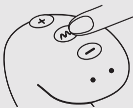
● Modes of vibration