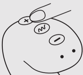
● ON/ increasing the vibration

Please make sure that your Gvibe toy is compatible with the GringXL. The GringXL and the Gvibe toys connect automatically right after turning on. This is how you can manage the toys by Gvibe now: