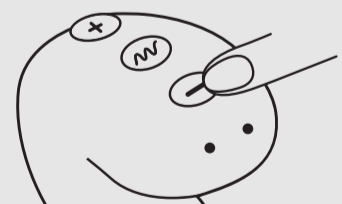
● Decreasing the vibration / OFF